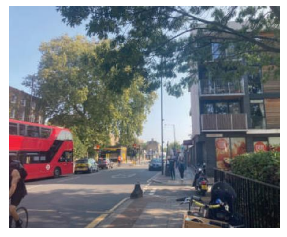
West elevation as viewed from Hackney Road

North elevation as viewed from Hackney Road