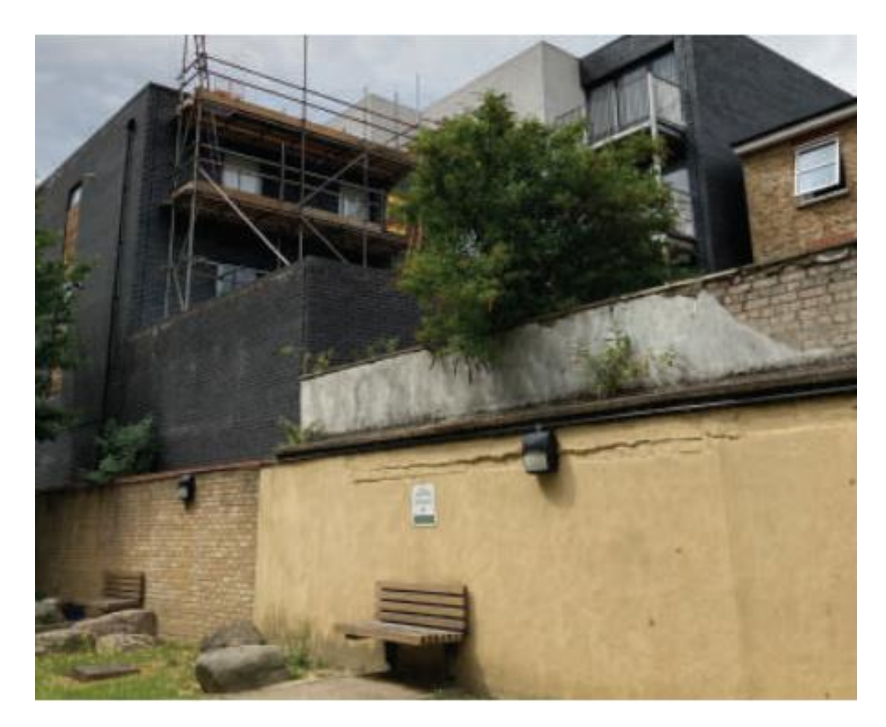
Rear elevation as viewed from garden associated with Cadel House